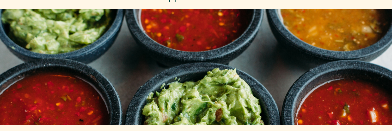
*All prices are per person. Must order in increments of 5. Does not include tax or gratuity.

(filled with choice of meat and topped with house red sauce and cheese)