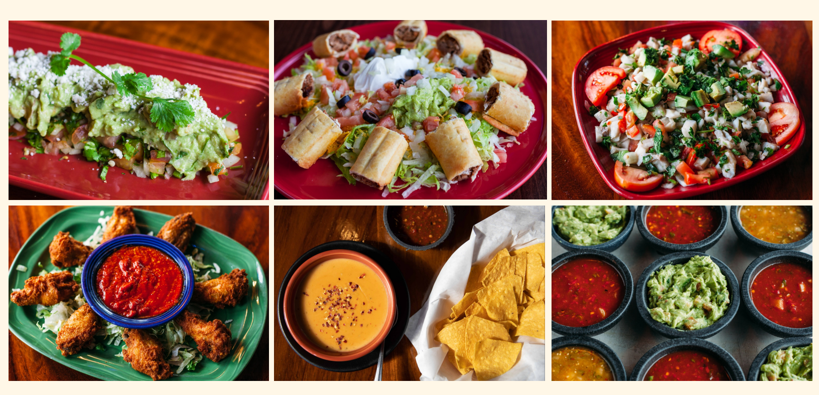
*All prices are per person. Must order in increments of 5. Does not include tax or gratuity.