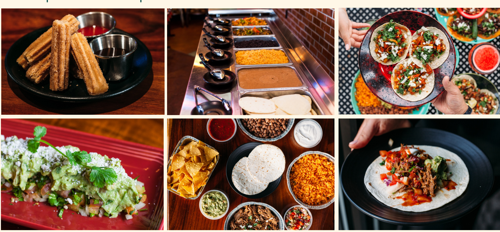
*All prices are per person. Must order in increments of 5. Does not include tax or gratuity.