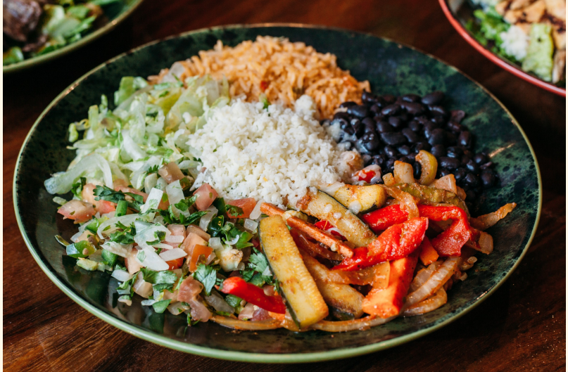
*All prices are per person. Must order in increments of 5. Does not include tax or gratuity.